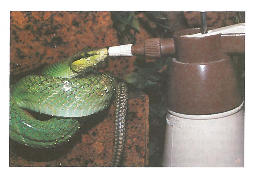
Foto 2. Gonyosoma oxycephala, vrouw / female.